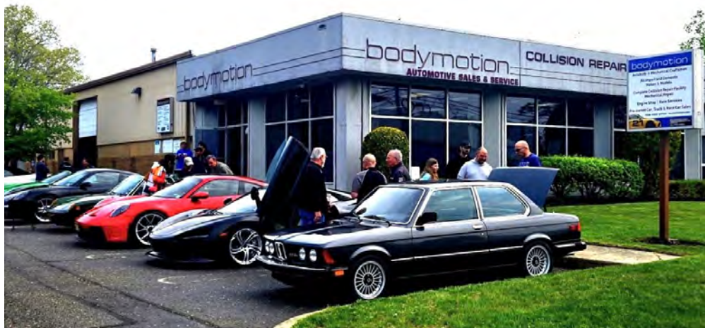
C&C at Bodymotion - Photo by Curt Watts